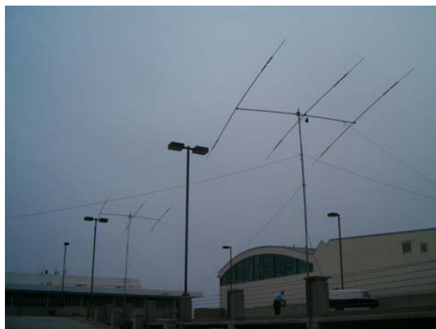
Antennas up and running

Pay your dues on time and stay connected