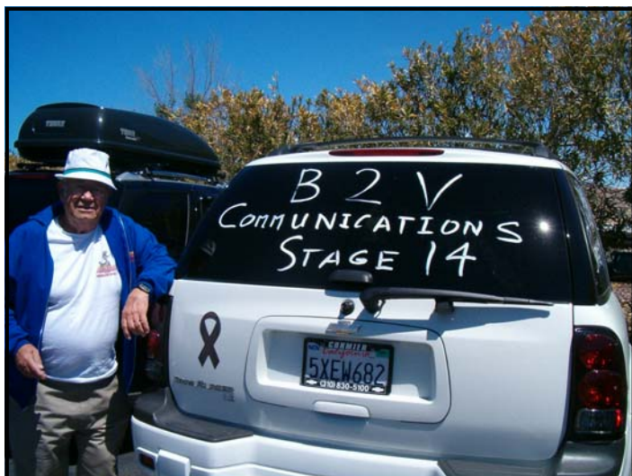
2007 B2V Relay Race Packing for 2008 Stage 13