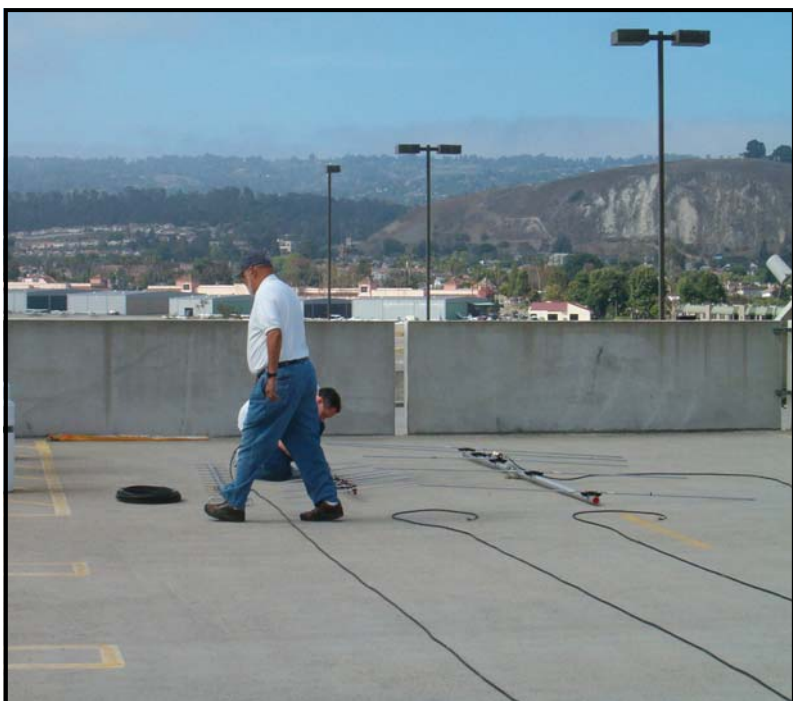
Field day 2007 laying out cables to set up antennas Are you getting ready for 2008